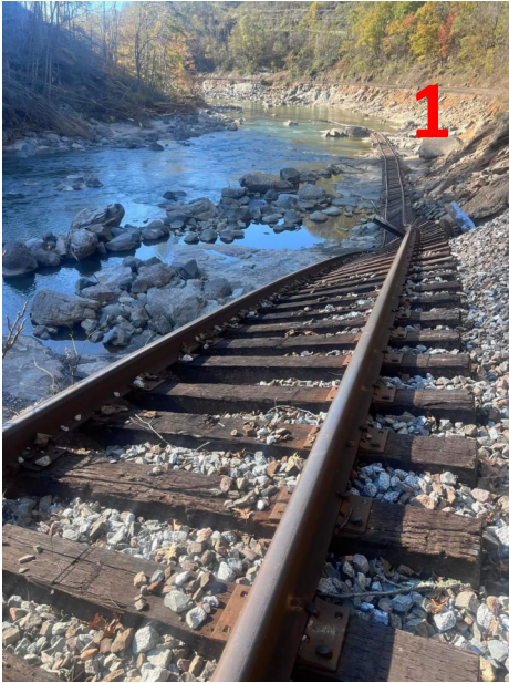
Photos 1 and 2 depict the monumental recovery effort facing work crews. What's amazing in #1 is how far off of the ROW the track was moved by the river.