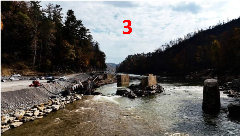
Photos 3-4 (Poplar, NC) and 5 (State Line) show bridge work underway.