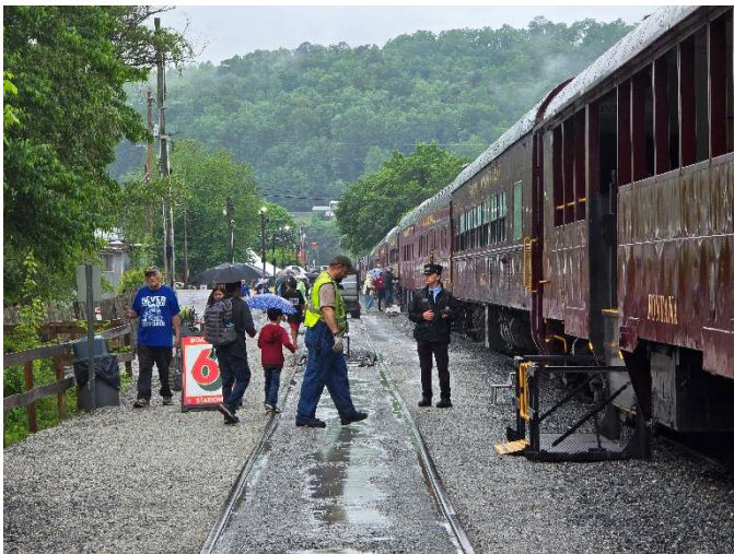
[Above] Loading had begun with a few sprinkles left over.