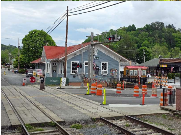
[Left] Well, we have arrived back to the depot after a nice ride. There is still a little construction going on, next to the depot as you can see. Then ack to the buses for our trip back to Johnson City.