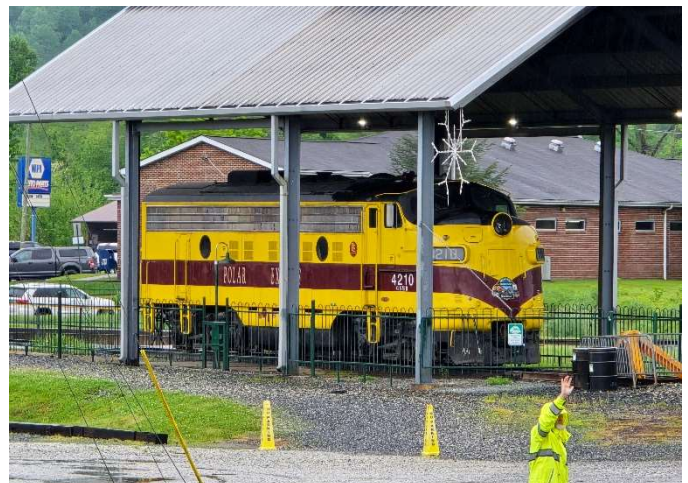
[Below] The RR.' s F-Unit under the shed as we left the station.