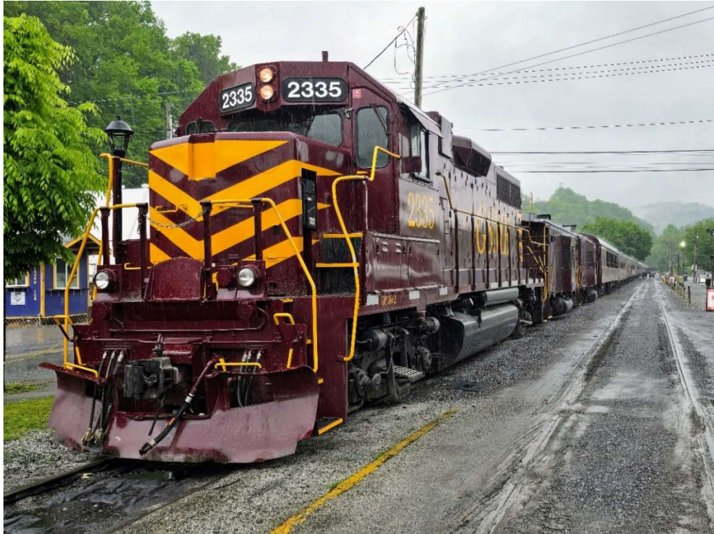
[Above] Before the monsoon set in, I was able to get a shot of 2335, a GP38-2, that was going to lead us on today's trip. We then proceeded to get a bagel, at the Depot Snack Bar and wait out the rain. A real gully washer.

Hope everyone is having a good Spring and looking forward to a good Summer. This month's "Display in the Block" will cover our Excursion my wife and I worked on May 4 th at the Great Smokey Mountain Railroad. This was my 5 th time as a bus host, and I enjoyed it each time. Even though we had a little rain, well maybe a lot of rain just after we unloaded the buses, it did let up and all had a good enjoyable trip.