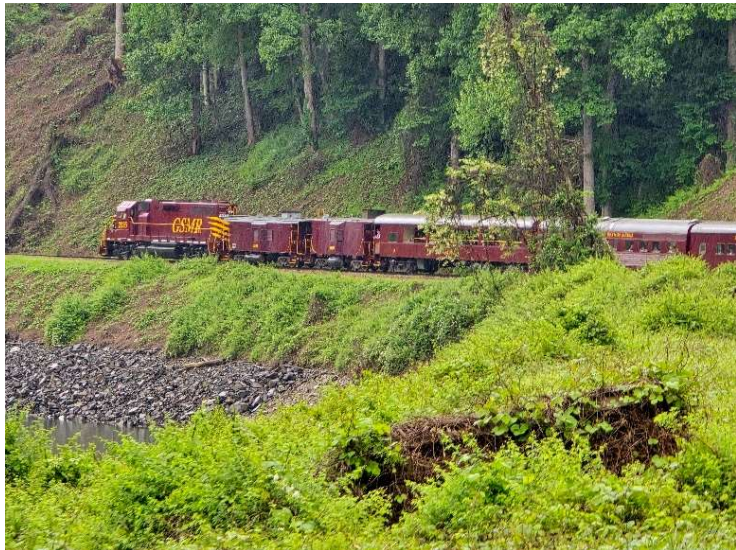
[Above] GSMR 2335 pulling us up the gorge towards the Nantahala Outdoor Center

[Below] It is always enjoyable to see the rafters going down the river. One of the days we will need to get a group together and do the rafting.