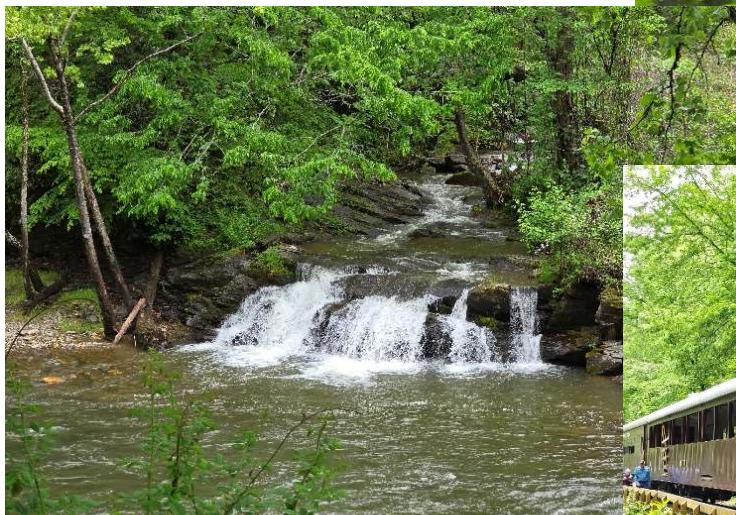
[Left] This nice little waterfall is at the outdoor center and can be photographed better once your stopped on the return layover.