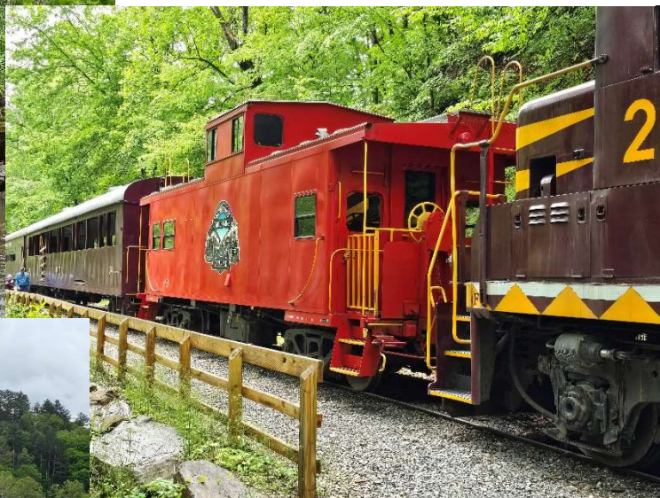
[Above] After we stopped for the layover, I walked to the back of the train, the front end as we return, and took a shot of this neat caboose. I would like to take a ride in it someday.