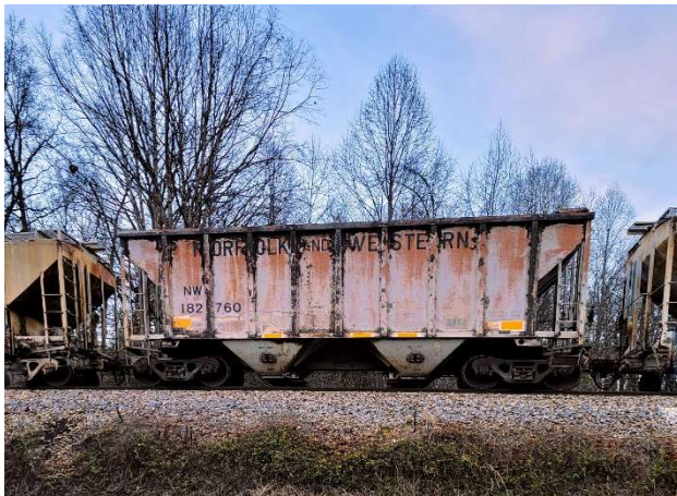
[Above] December 6, 2022, this rustic Norfolk and Western Covered Hopper #182760 heading west through Johnson City on NS13Z.