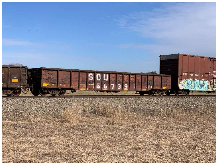
[Right] January 30, 2022, is when I ran across this Southern Gondola #66739. I was in Limestone on a chilly afternoon.