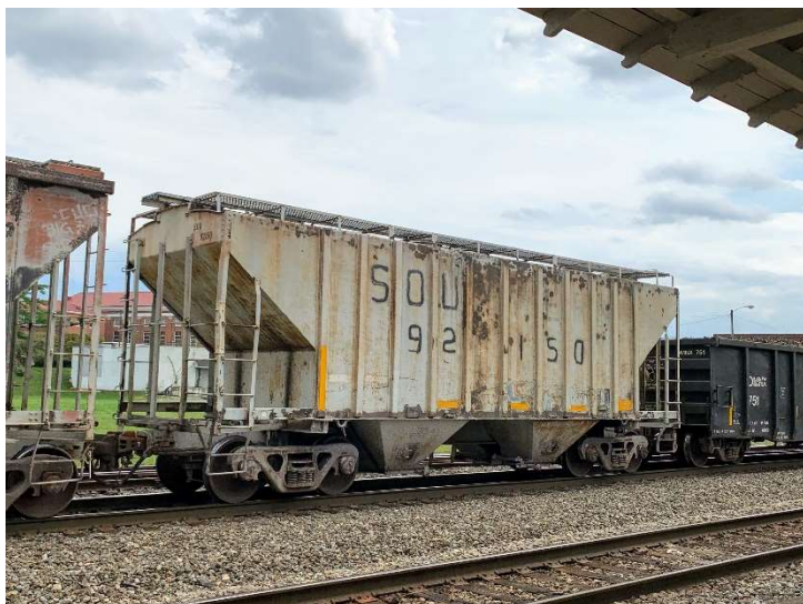
[Left] September 5 th , 2021, I found this Southern, short 2-Bay Covered Hopper # 92150 at the Bristol Depot. NS 126 had pulled down the siding and stopped to make a crew change and probably drop and add a few cars.