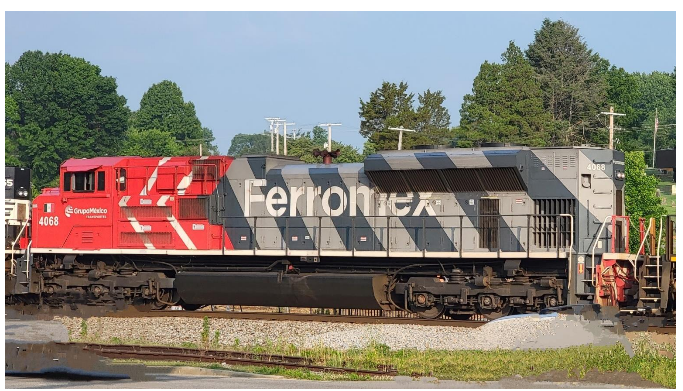
[Above] After observing NS 278 passing by the Chuckey Depot Webcam in Jonesborough, I wanted to catch the Ferromex new paint scheme. It was the 2<sup>nd</sup> unit. So, I waited about 15 minutes and ran out the back of work and snapped away.