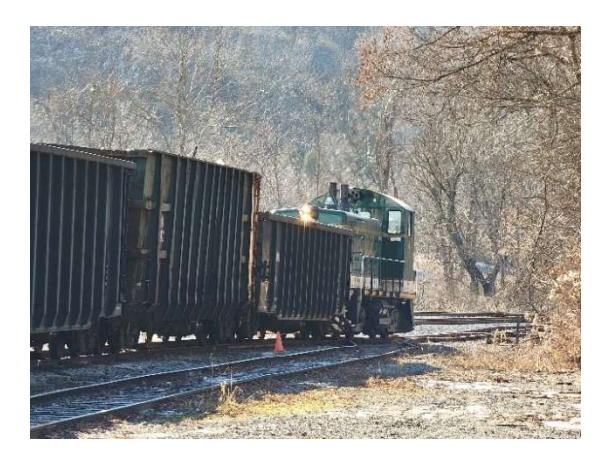
[Above] After delivering a few box cars to ST Logistics, it pulls back down the old 3C's track and on to work its daily moves.