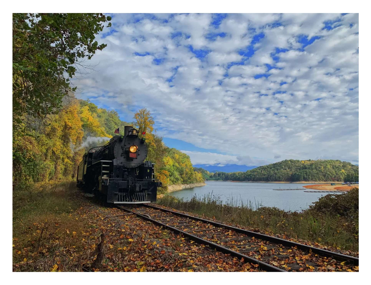
WVRHS&M announces its first-ever steam excursion on the Great Smoky Mountains Railroad!. Story on page 4.