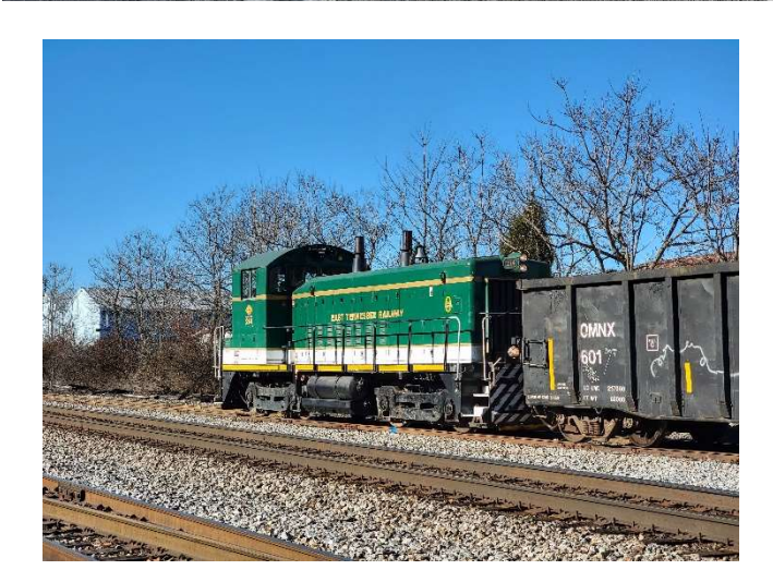
[Above] #214 shown here with a OMCX (OmniSource) car. OmniSource is one of its largest customers. The NS mainline can be seen in the foreground.

[Below] ETRY is crossing over the NS Mainline, where it had to get a track authority to do so. It keeps this authority as long as it does its work which most days takes an hour or so.