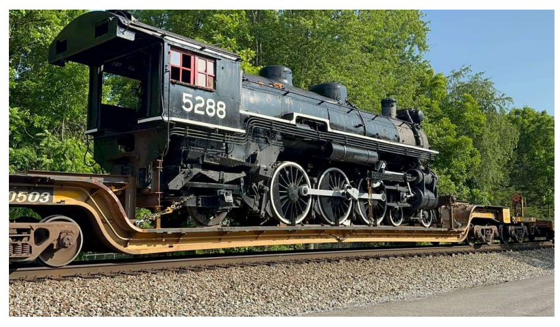
#5288 passes by Chuckey Depot on its journey to Pennsylvania.

The Tennessee Valley Railroad Museum (TVRM) is transferring historic steam locomotive 5288 to a preservation trust in Pennsylvania. Colebrookdale Railroad Preservation Trust will display the locomotive near a railroad station in Boyertown, Pennsylvania.