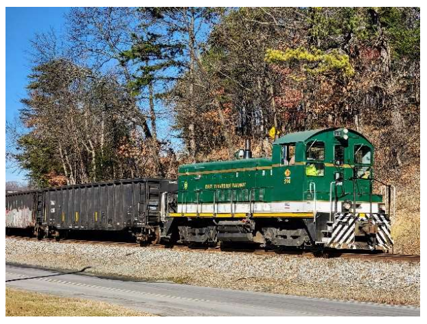
[Above] Paralleling City Garage Rd., 214 has picked up a few additional cars and is moving them up the yard connector track (3C's) to make a delivery.