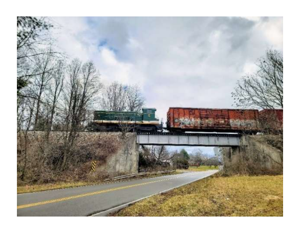
[Above] On a lunch hour adventure, I caught ETRY crossing the old Clinchfield bridge on Buffalo Road.

[Below] The conductor holds on to the last car as it moves toward the NS Mainline and into Carnegie Yard. They will probably work some empty cars left there the night before by the Greeneville switcher.