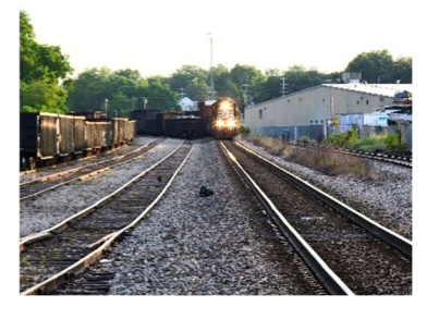
(Above) The Greeneville Switcher is entering Carnegie Yard. (Right) We see the GS as is pulling through to the end of the Yard. It will soon be crossing Broadway Street moving just far enough to clear the switch so it can back into one of the staging tracks and deliver and set off some cars for the downtown location of OmniSource.

In this month's Display in the Block, we will look at a series of photos of the 2 local switchers. It has taken me a while to be able to get these as since one comes through late some nights and the other does its work while I am working myself. We will see the Greenville switcher and the East Tennessee Railway switcher doing some work in downtown Johnson City. June 16<sup>th</sup> and 17<sup>th</sup>.