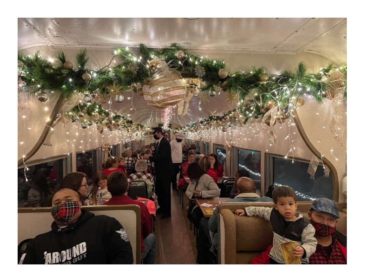
"Polar Express" trains. See photos below.

"Powhatan Arrow" coach (WATX 539), "Moultrie" diner (WATX 400): "Clinchfield 100" office car (WATX 100), and "St Augustine" coach (WATX 500): all four cars are in service at the North Carolina Transportation Museum on their