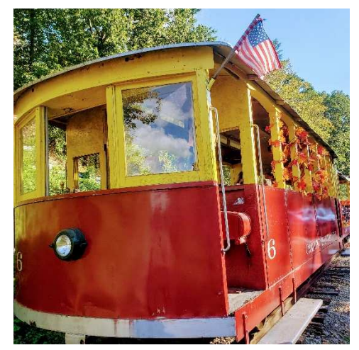
taken on the day of the trip.

WVRHS&M is inviting all our members to come out on Saturday November 6<sup>th</sup>, 2021 at 1 pm and ride the rails of the Craggy Mountain Line for a 4-mile trip over the Craggy Mtn to Riverside Park in Asheville. The cost is $5.00 per person which includes the Trolley Ride along with a tour of the engines, cabooses and other equipment at the Craggy Mountain. The Craggy Mountain Line is located at 111 North Woodfin Avenue, Asheville, NC 28804. Please mail your check to Watauga Valley Railroad Museum, P. O. Box 432, Johnson