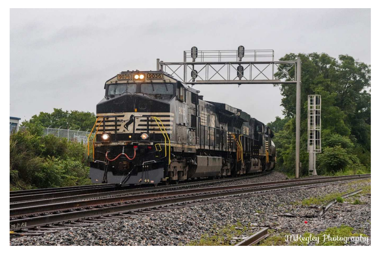
this 163 as it was setting off cars in Bulls Gap Yard; we didn't really care what the power was as we just wanted to go get a train here. And we did just that! I'm pretty pleased with the outcome!!

A few weeks prior.... Before the PSR went in effect on NS I caught this NS 163 at New Line in Morristown, TN which is where the NS A line and S line meet. My friend from Bulls Gap rode along with me. Even though it was absolutely pouring rain we still went after this train because neither of us had shot a train at this particular location before. We ended up seeing