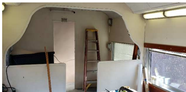
Waiting room space for dining room is temporary workspace.

VOLUNTEERS NEEDED! An extra pair of hands always comes in handy as there’s plenty of work for all skill levels. And what a unique opportunity to help remodel this historic railroad car. If interested, call us at 423-753-5797.