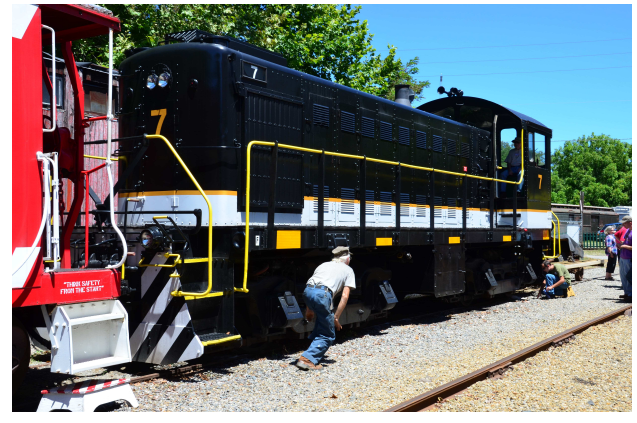
The CML crew "fired-up" their ALCO S3 No. 7 to the delight of attendees. The former Pennsy switcher was acquired by CML in 2012 from the Alexander (NC) NRHS chapter.