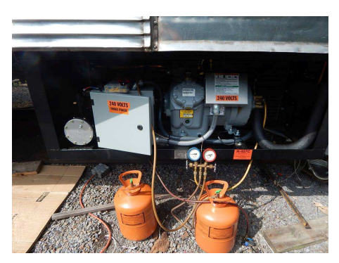
Jonesborough Coach Yard.

"Clinchfield" business car (WATX 100): Is at the North Carolina Transportation Museum on display in the round house.