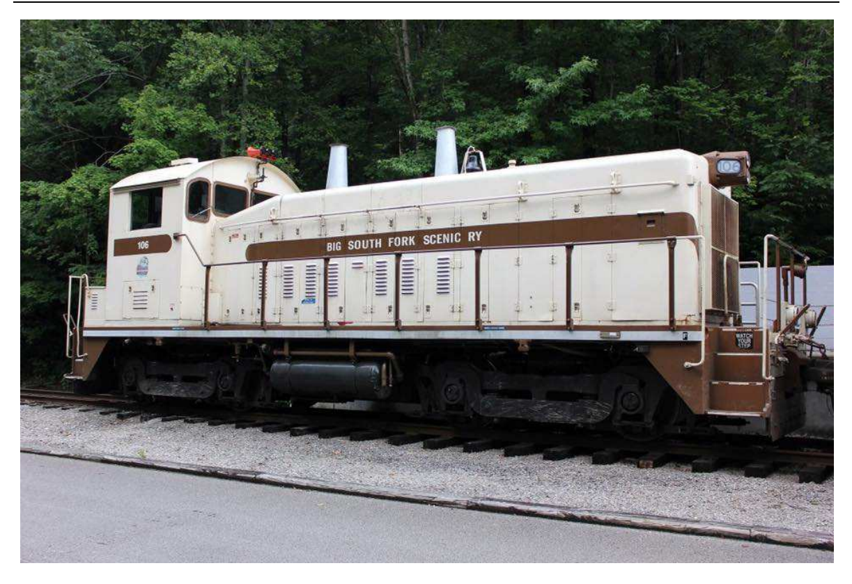
Big South Fork Scenic Railway

Several WVRHS&M members will be treated to exciting railfan activity on June 24<sup>th</sup> as they travel to Stearns, KY and ride the BIG SOUTH FORK SCENIC RAILWAY. Pictured above is one of the line's motive power, EMD-built SW9 switcher #107.