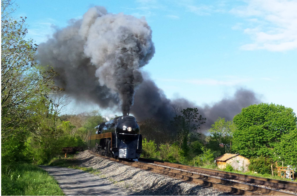
Just can't get enough of the 611 under steam. This magnificent May 7 th shot of the locomotive climbing Southwest Virginia's Blue Ridge grade trailing a dramatic plume of smoke was taken by railfan Brian Crosier.