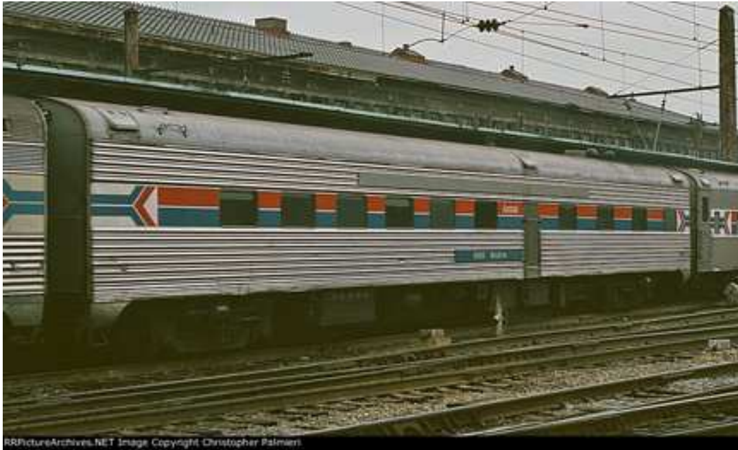
WVRHS&M “Moultrie” which just joined AMTRAK service in 1972 at Ivy City (Washington, DC).