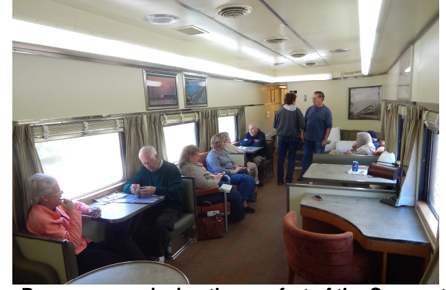
Passengers enjoying the comfort of the Crescent Harbor during the October 17<sup>th</sup> "New River Train".

A lot of upgrade work is planned for the future which will be announced at a later date.