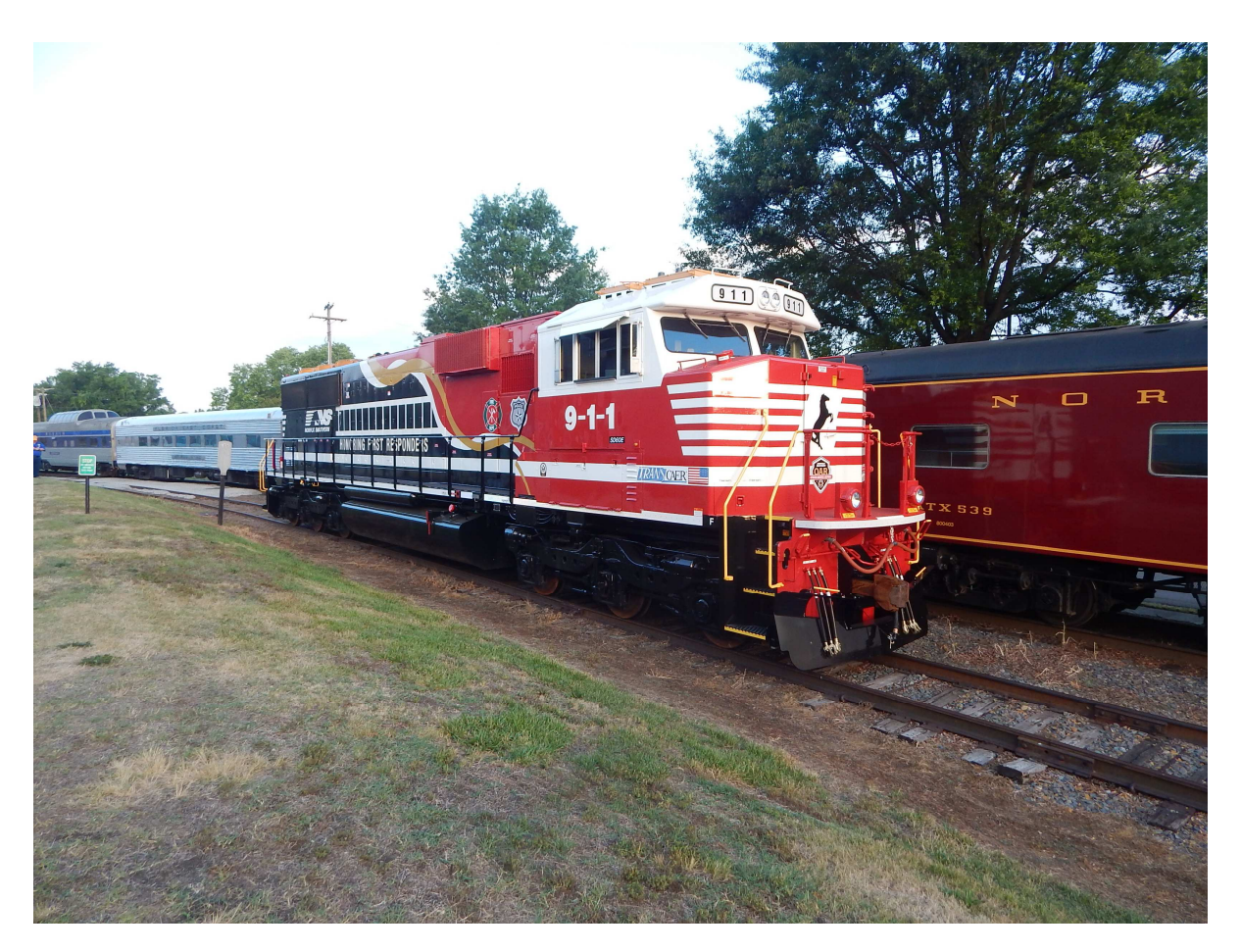
NS SD60E locomotive 911, dedicated to First Responders, parked next to Watauga Valley's coach "Powhatan Arrow" at NCTM in Spencer.