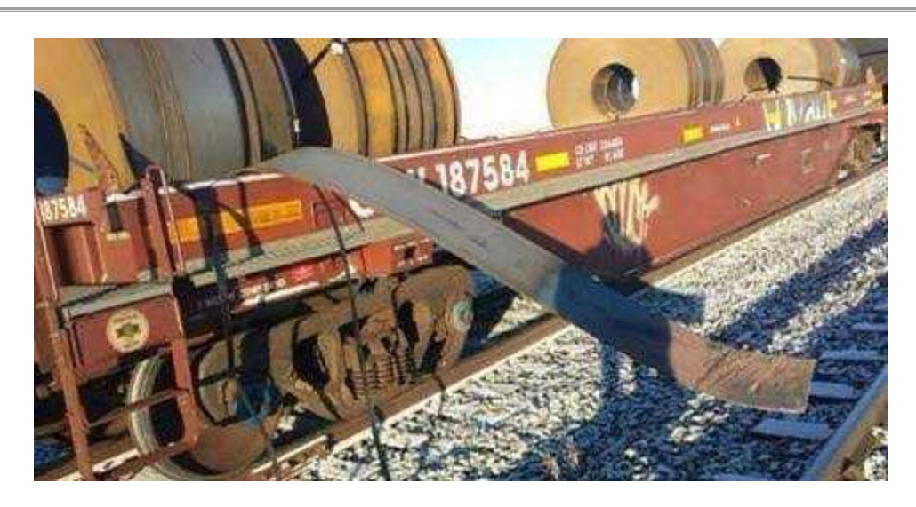
The photo above, circulating the railfan digital network, serves as evidence as to why it is UNSAFE to walk or stand along active rail trackage.

And so very soon, the locomotives will depart Staunton one final time on a long railway trek north. They will ride the rails once more — not under their own steam, but instead as passengers headed home to Canada.