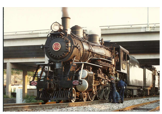
The #152 being serviced in Johnson City prior to Watauga Valley's June 1987 excursion to Natural Tunnel, VA. [Photo; Fred Waskiewicz]

The Kentucky Railway Museum in New Haven, KY, plans to evaluate No. 152 for a two-phase restoration. The Pacific was built by the Rogers Locomotive Works in 1905 and was used to power excursions at the museum. However, the engine has been out of service since the fall of 2011 due to leaking boiler tubes at the bottom of the rear tube sheet. The museum is seeking donations and volunteer workers to return the locomotive to service. [Trains Magazine Newswire]