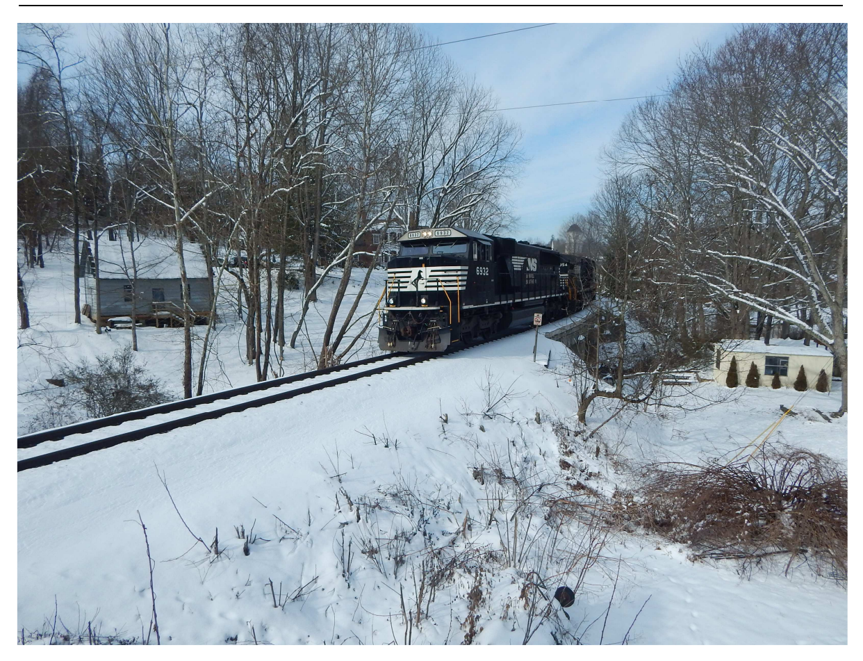
New England? No, Tennessee. Mike Tilley captured this eastbound NORFOLK SOUTHERN freight rolling through Jonesborough, TN on a snowy, wintry day.