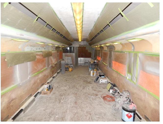
View of interior painting work on the 539 at NCTM.

500 "St. Augustine" coach: Has arrived back at the Spring St. Coach Yard to finish some work. The mechanical team is