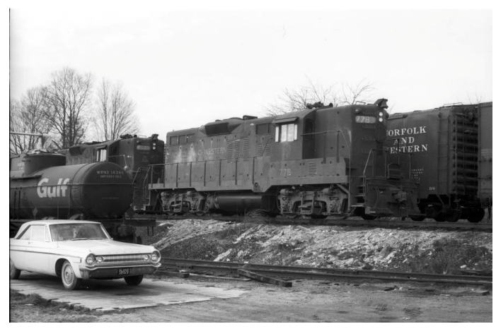
N&W GP9 #778 powers the First Saltville Shifter, captured at Glade Spring, VA in December 1965. Can any of you car aficionados identify the model and year of the Dodge on the foreground?