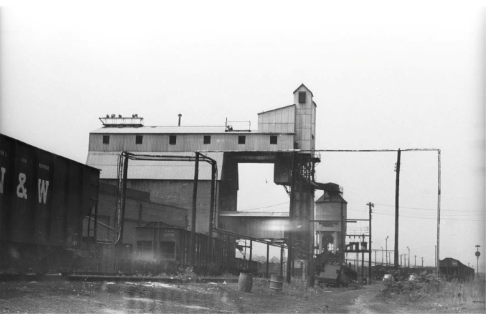
And while on the topic of modeling, the really ambitious among you might consider building a scale model of this Shaffer's Crossing coal wharf for your layout.

A photo album of our October 12<sup>th</sup> excursion, along with shots of deadhead moves to and from Spencer, can be viewed at <a href="http://tinyurl.com/l8v9gsj">http://tinyurl.com/l8v9gsj</a>.