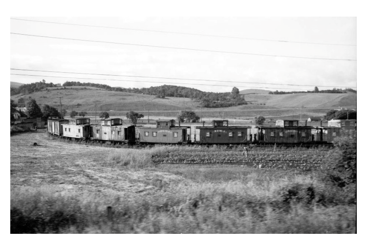
A string of VIRGINIAN cabooses sit forlornly on a siding at Atkins, VA, awaiting a sad fate after years of service.