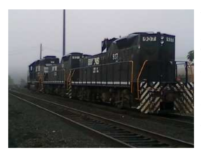
Mingo Junction yard power awaits an assignment. Pictured are RP-E4D #937 and #921 and SD-40-2 #3430.

the weather alert went off that a storm was fast approaching. We barely had time to get our rain gear on when the storm hit carrying 40 mile an hour winds with it. As we five employees looked back a half mile to the rest of the gang, the storm kicked up the dirt with such force that it resembled a tornado as it swept across the yard, covering all the machines and the other employees in a sticky mist of mud and rain, I was thankful that I was already out of the yard. I just got a little wet while the other guys looked like they had just climbed out of a coal mine. After the storm passed, two beautiful rainbows stretched across the yard, which kinda made me think back to Bible Study and Noah and the Ark.