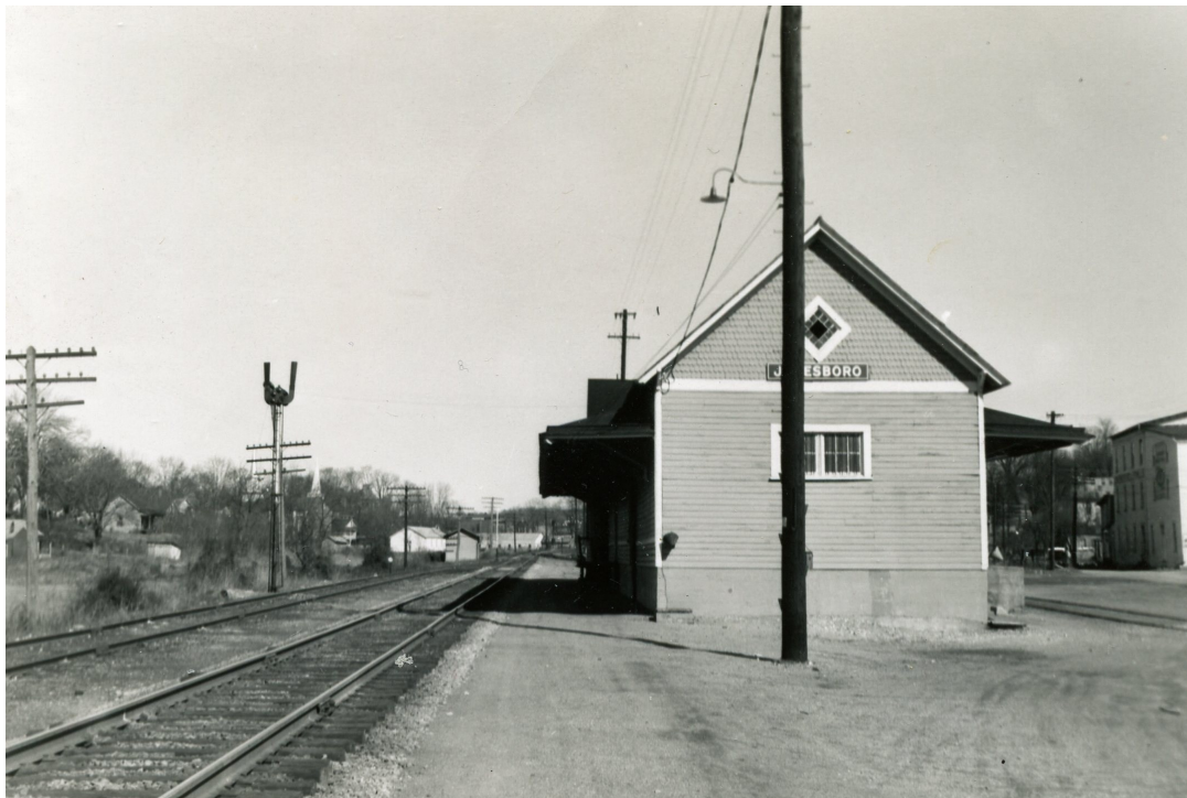
Jonesborough: Looking east at the 2nd Jonesboro Depot. The foundation can still be seen standing. Dated 1958 with semaphore and passing track.